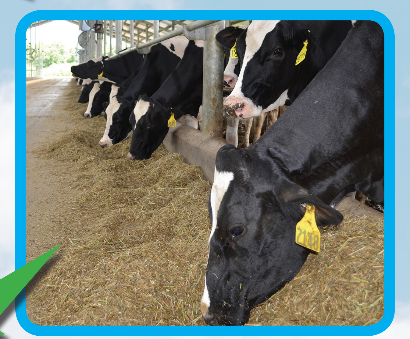
Cows can eat and drink 24 hours a day to give them the nutrients they need to be healthy and produce nutritious milk.