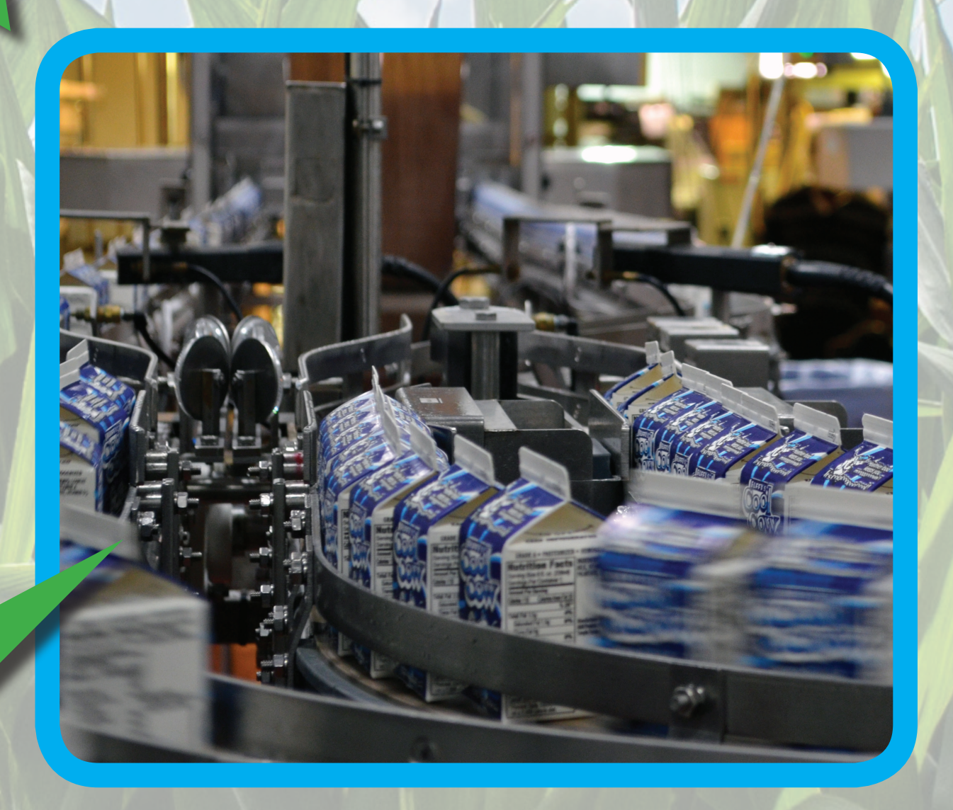
At the processing plant, milk is thoroughly tested before being packaged.