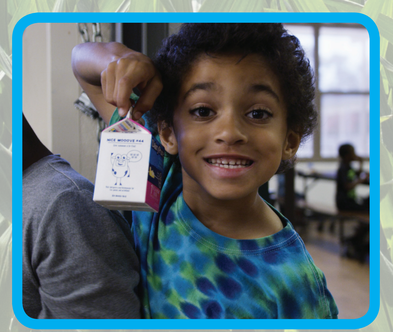
A carton of school milk provides 9 essential nutrients to fuel your body and mind.