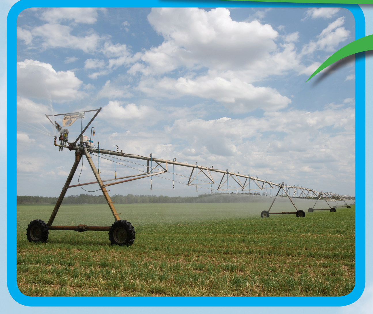
Recycled water from other parts of the farm is used to grow crops, which help feed the cows.