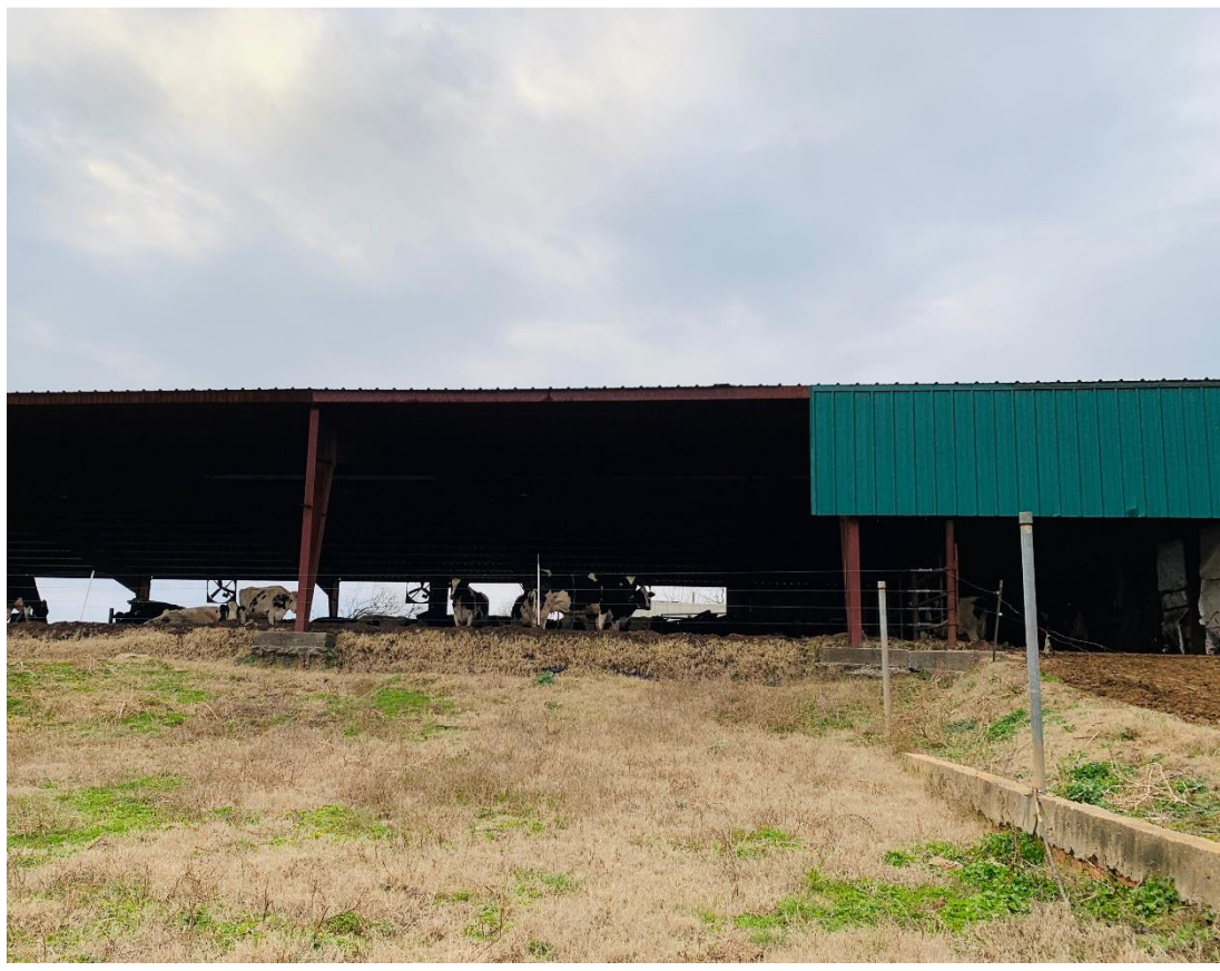
This is the Pack Barn where 501 and her herdmates can go for shelter and shade.