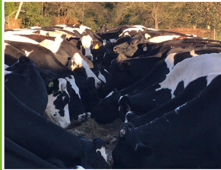
The milking cows are fed a custom feed blend and get to munch on grass and hay outside all year long!