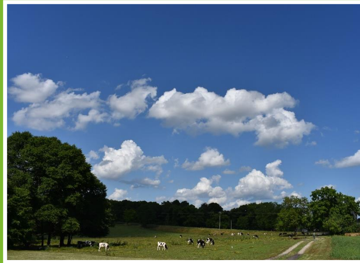
The barn is connected to the wide-open fields of Big Sandy Creek Dairy where 501 can graze all day and enjoy the sun.