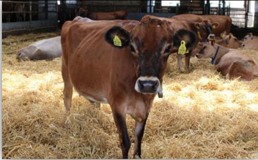
Care & Cleanliness