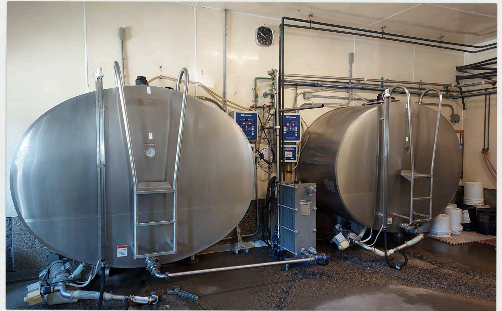
Milk Tanks In a Milk House