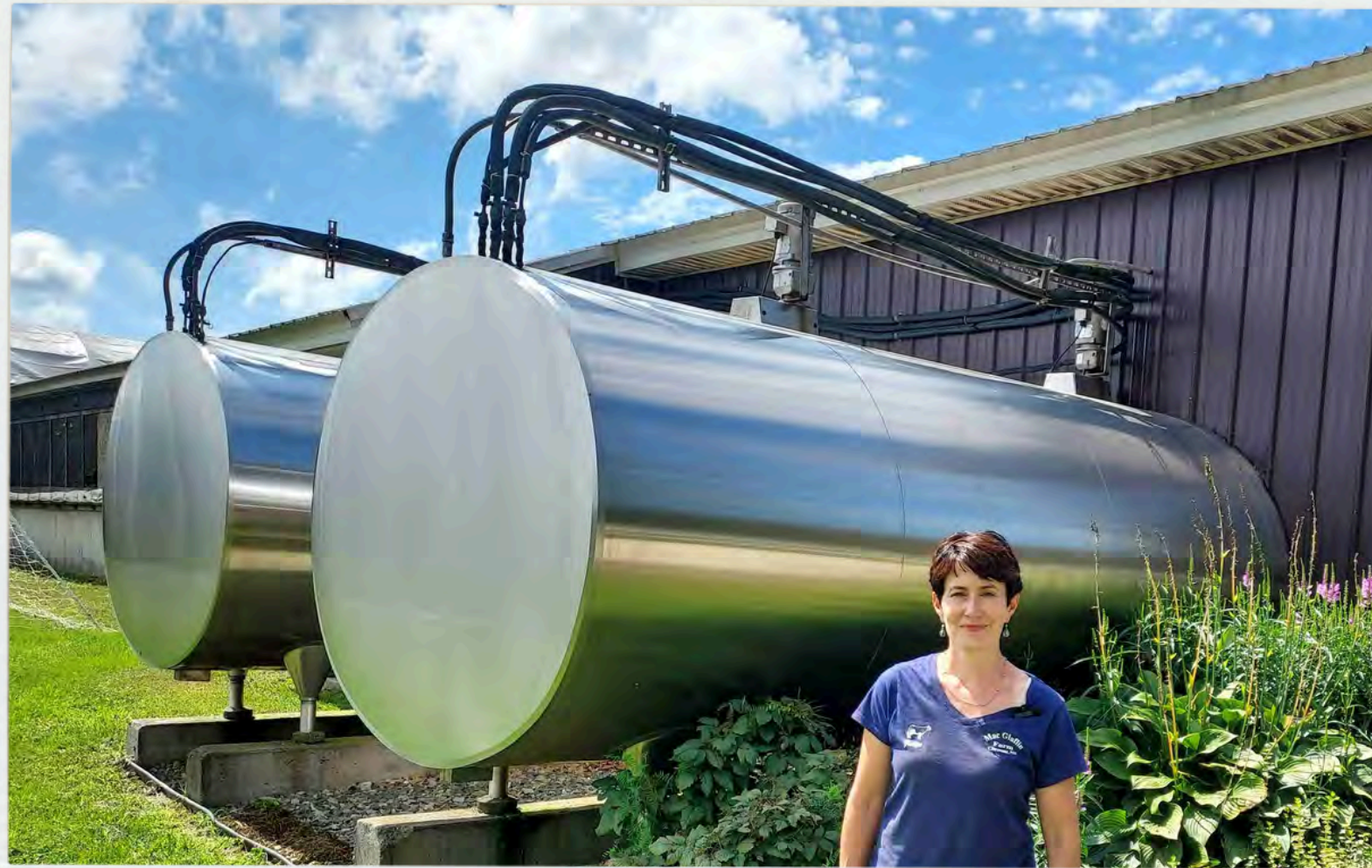
Milk Tanks Outside

Definition: a special container that holds cold milk for the farmer, also called a bulk tank