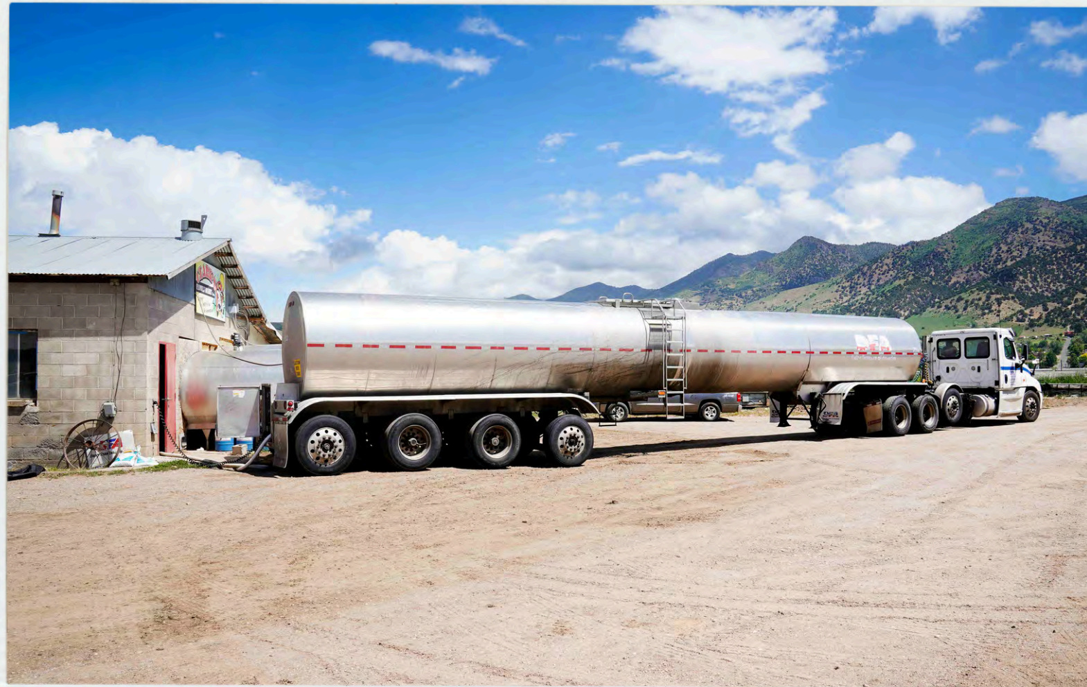
Milk Truck Picking Up Milk

Definition: a person who takes the milk from the farm to the milk plant