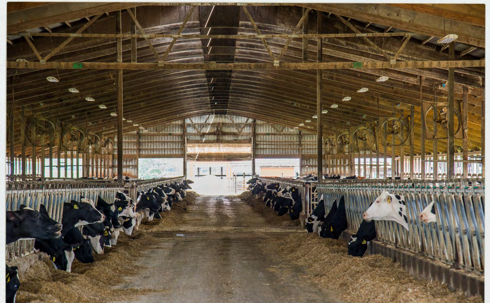
Inside of a BARN