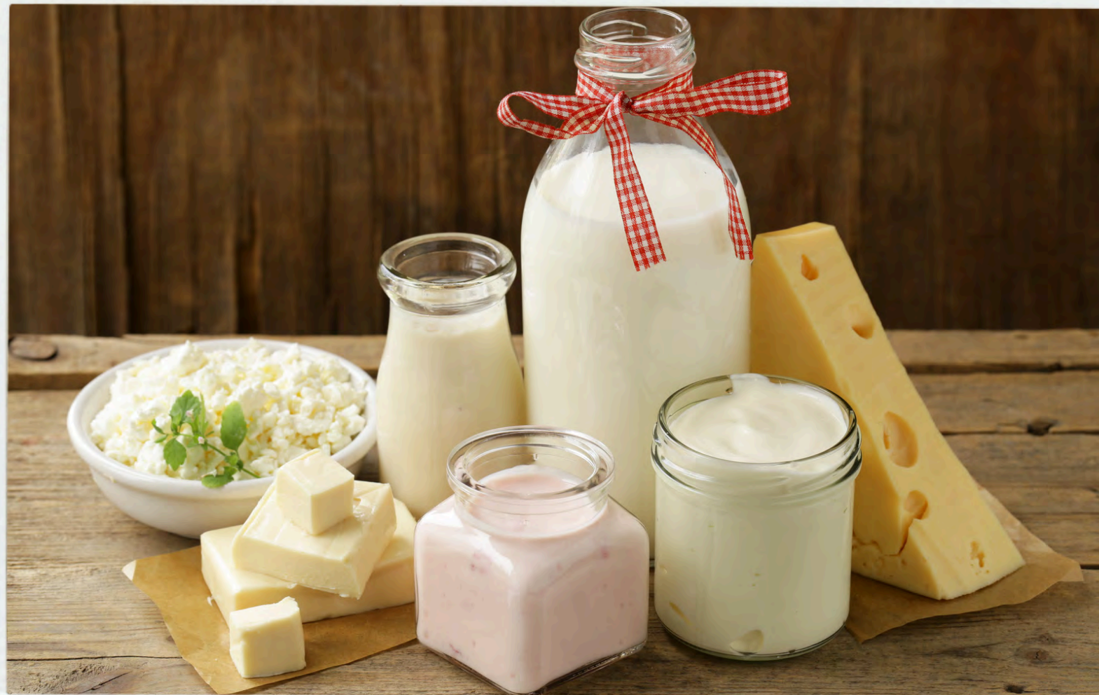
Milk, Cheese, Yogurt, Butter, Cottage Cheese, and Sour Cream