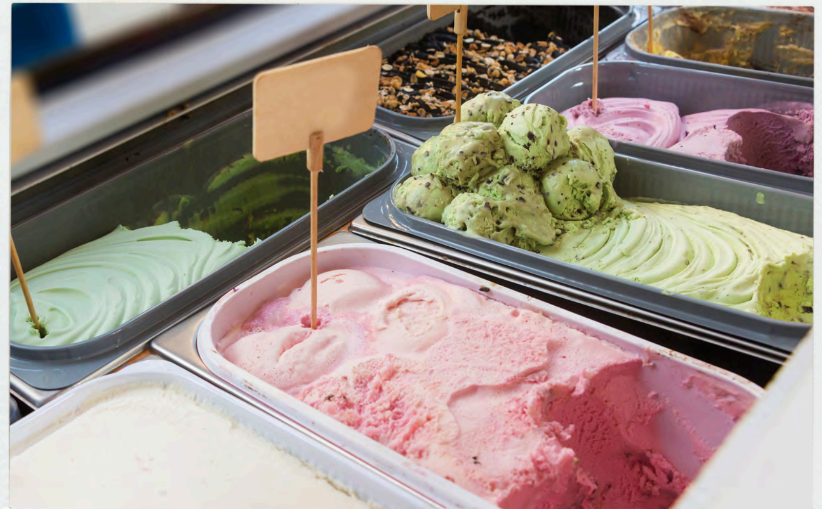
Ice Cream and Frozen Yogurt