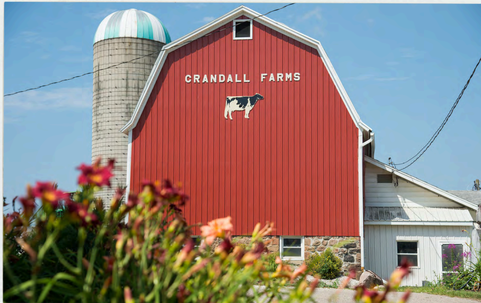
Outside of a BARN