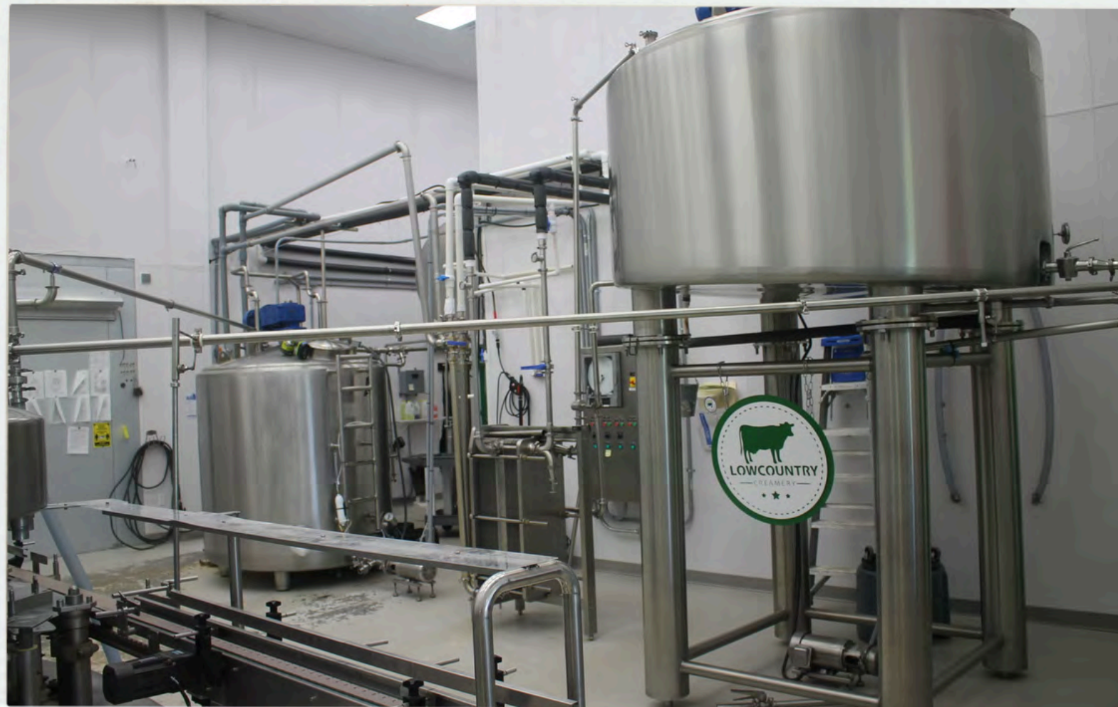
Milk Processing Plant Machines

Definition: a place that takes milk, makes milk safe, and makes other foods from milk